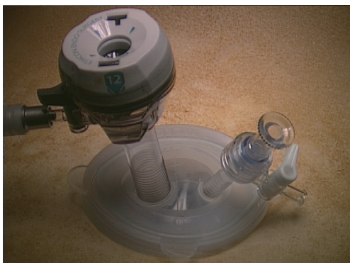
Figure 1 Our setting of the RPLG. We used the wound retractor of 4 cm as the multi-channel-ports at the umbilicus. On addition, we used one 12 mm and one or two 5 or 3 mm trocars. RPLG, reduced port laparoscopic gastrectomy.

But the surgeon felt much stress to manipulate the tissues during the surgery.