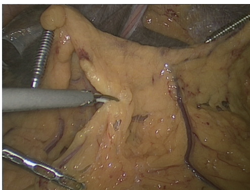
Figure 2 To reduced laparoscopic ports, we used EndoGrab™ instead of the grasper.

In our series, same results were revealed even in the small number of the cases. We also used multi-channel device at the umbilicus and needle devices in addition to