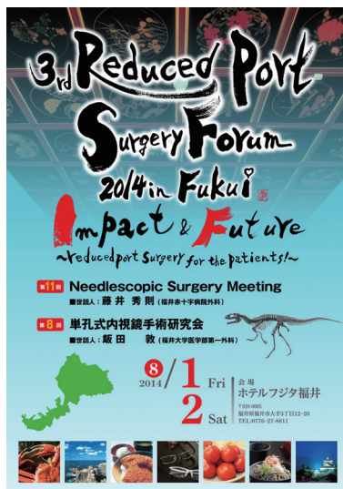
Figure 4 The poster of the meeting: 3 rd Reduced Port Surgery Forum 2014 in Fukui.

There are three problems for the reduced port surgery. The first is the suitable instruments and their innovation. The second is technical difficulty for the operation itself. And the third is the education for the surgical skills. The third problem is the most important for this field. So, we had the surgical meetings of reduced port surgery for the improvement, the skills, devices, and the education. The problem might be solved by the standardized procedure of the laparoscopic surgery with the reduced port settings.